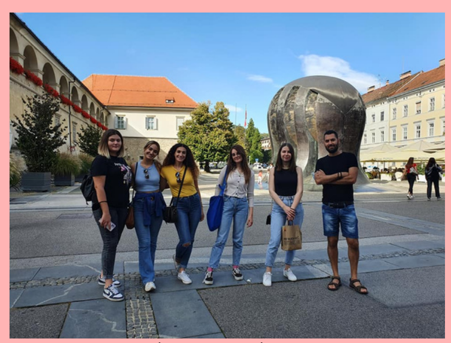
Maribor, september 2021