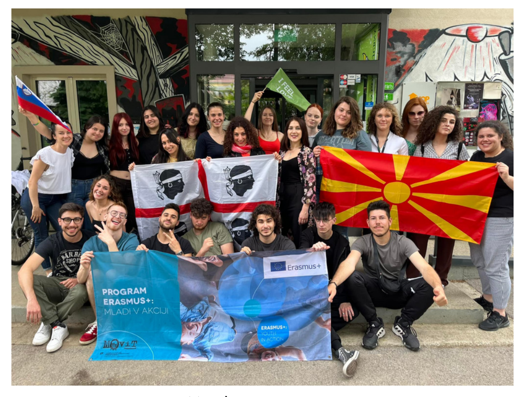
Maribor, may 2022